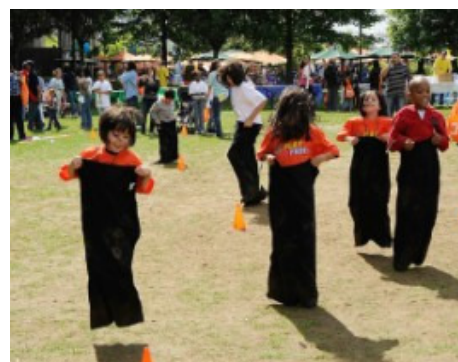
Kids having fun at last year's Worldwide Day of Play.

Adapted from "Garden City Patch" with permission.